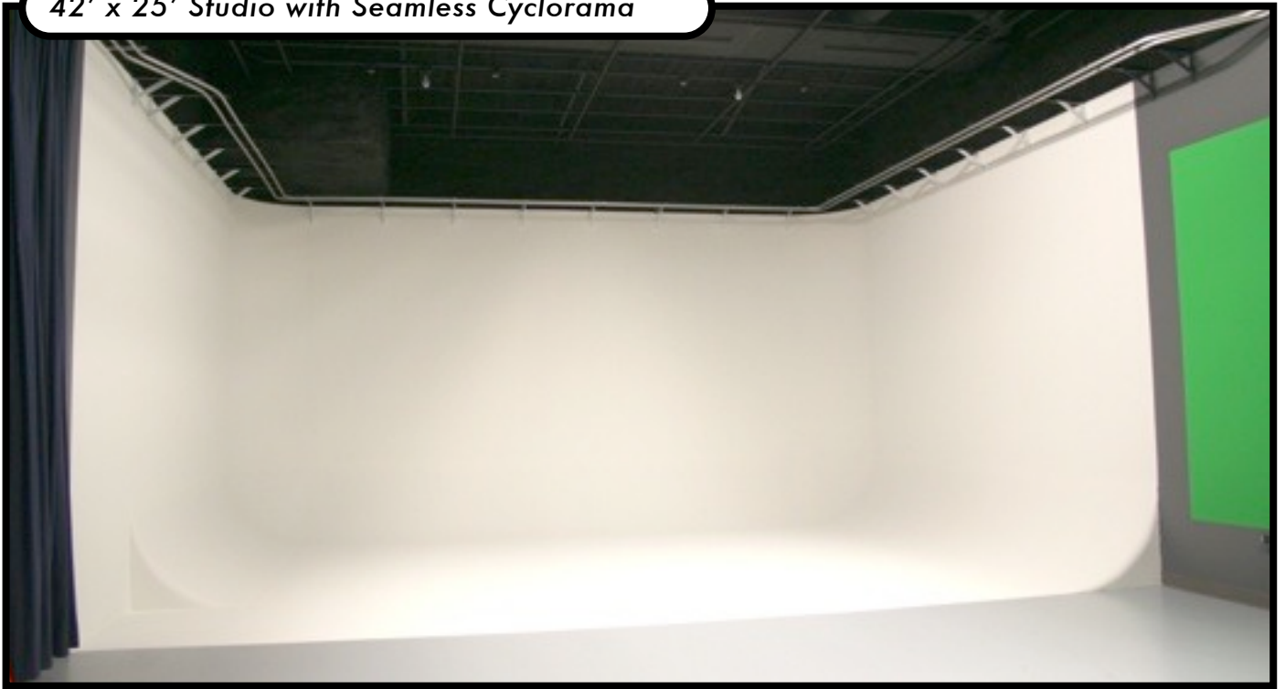
42' x 25' Studio with Seamless Cyclorama